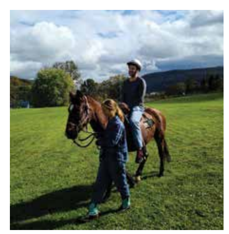
CHURCH FESTIVAL: Horseback riding at the church fall festival.