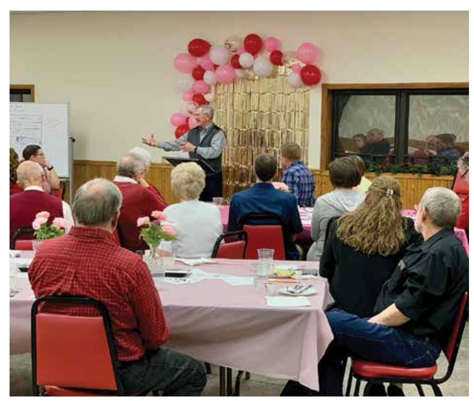
CELEBRATING COUPLES: Listening to the pastor at a couples dinner at Pennwoods Bible Church.

There is also a young adults group, Pathfinders, that meets every Monday evening and is aimed at high school seniors to those in their late 20s.