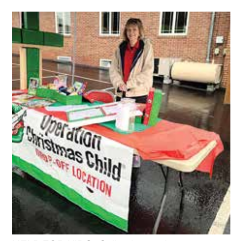
HELP FOR KIDS: Collecting packages for Operation Christmas Child

that will include Chinese, Mexican and other types of global food.