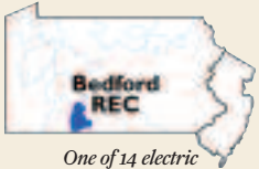
One of 14 electric cooperatives serving Pennsylvania and New Jersey

Bedford REC P.O. Box 335 Bedford, PA 15522 814/623-5101