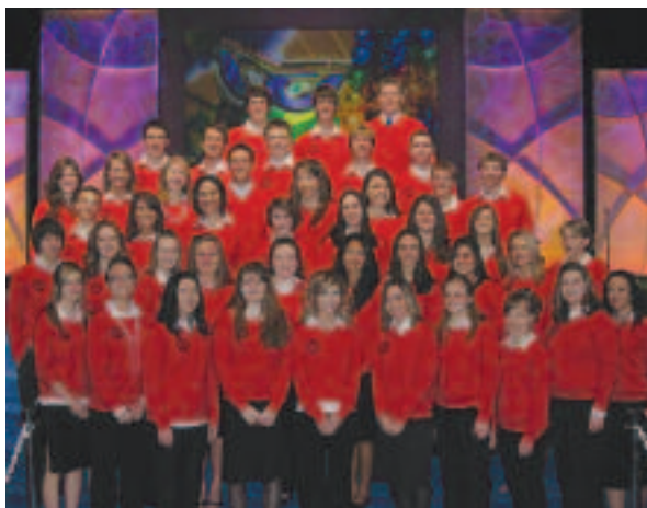
2009 Youth Leadership Council Red Shirts.

absolutely amazing trip! Along with the 42 other YLC students, we assisted those attending the conference by working in the information booths, ushering and working in the Congressional Action Center. I chose to spend most of my time in the Congressional Action Center sending emails to congressmen to promote “Our Energy, Our Future.” (By the way, have you signed your online letter yet? If not, go to www.ourenergy.coop ).