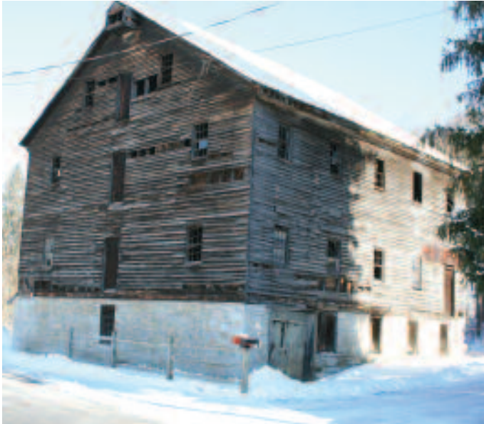
GRIST MILL: The Sarah Furnace Grist Mill is located off a side road near Claysburg. It operated into the 1950s.