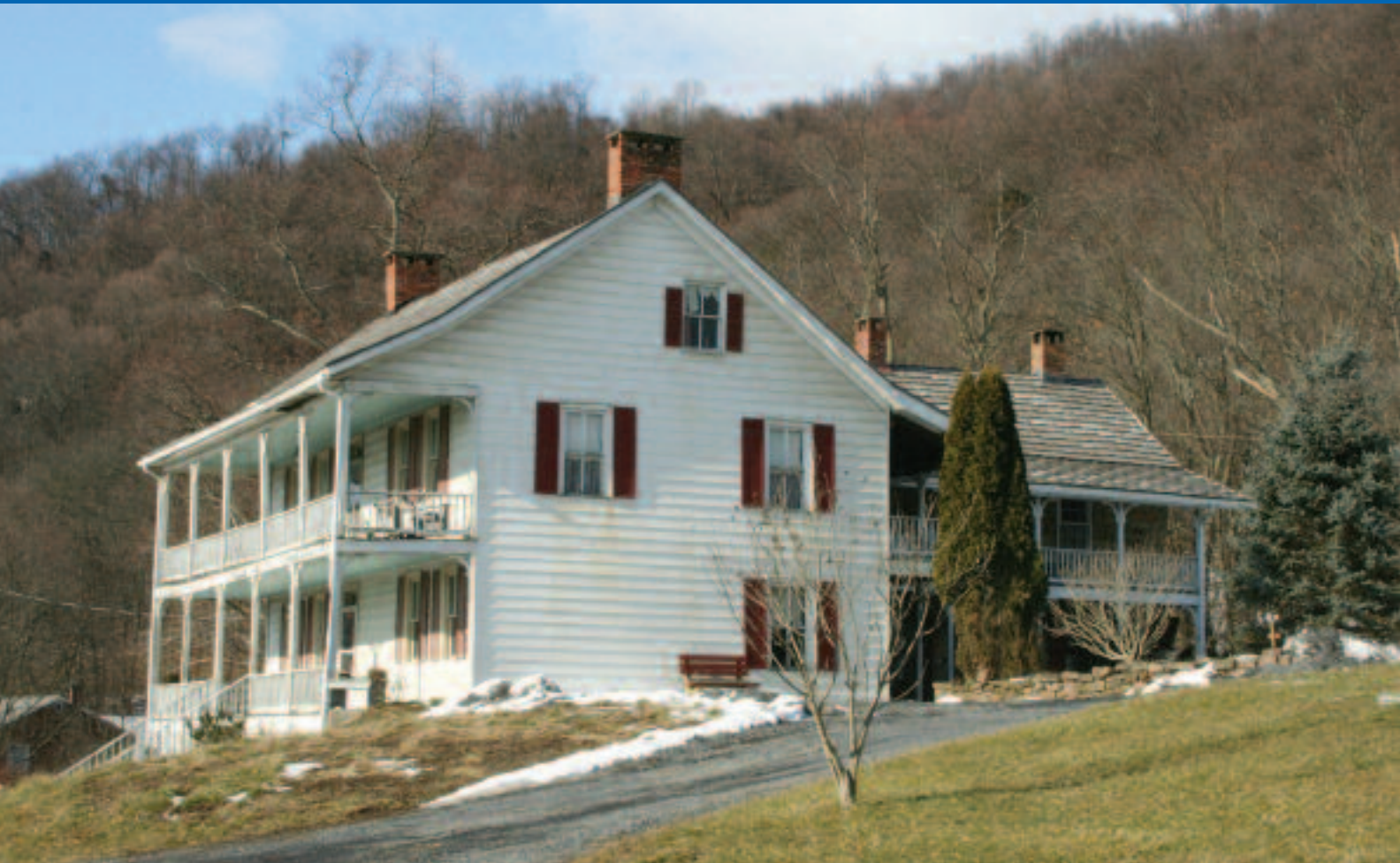
FORMER 1700S TAVERN: The Defibaugh Tavern, built in 1760, was a haven for travelers along early Route 30. Today, it is a private dwelling.