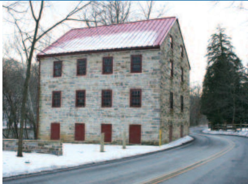
OLD MILL: There is a movement under way to restore the old Juniata Woolen Factory at Lutz. This mill manufactured Army blankets, woolen socks and flannels. It produced some of the clothing worn during the Civil War. It is located along the Juniata on Lutzville Road.

Part VI covers taverns, inns and hotels. Always a main thoroughfare, the county has had a need for lodging. Several of these accommodations are still in use, much to the delight of many tourists. One is the picturesque, stone Jean Bonnet where George Washington passed by on his way to quell the Whiskey Rebellion. Said to be haunted, it attracts many visitors in search of ghosts. The Bedford Springs Hotel and its delightful history were a welcome comeback to the area. Others still standing and in good condition are used for various purposes, including private dwellings.