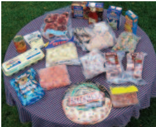
BOUNTIFUL: This display shows food purchased for $30 through the Angel Food Ministries.

For more information, check out angelfoodministries.com or Crossroads-bible.info . ☀