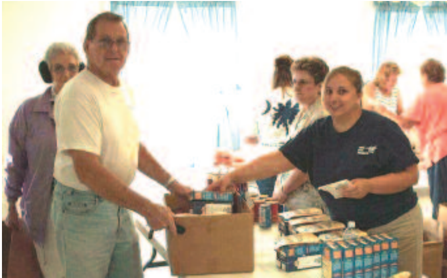
CARRYOUT: Folks line up for their food at the June distribution of the Angel Food Ministries at the East St. Clair Township Building. Volunteers are busy handing it out.

folks purchase two boxes, take one and leave one for someone who cannot afford the $30. Or, some send a receipt to a family in need and tell them to go pick up the food on the delivery date. These folks are helping others in numerous ways.