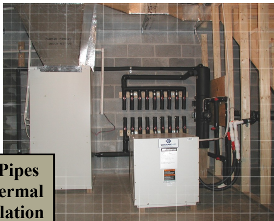
Manifold Pipes and Geothermal Unit Installation